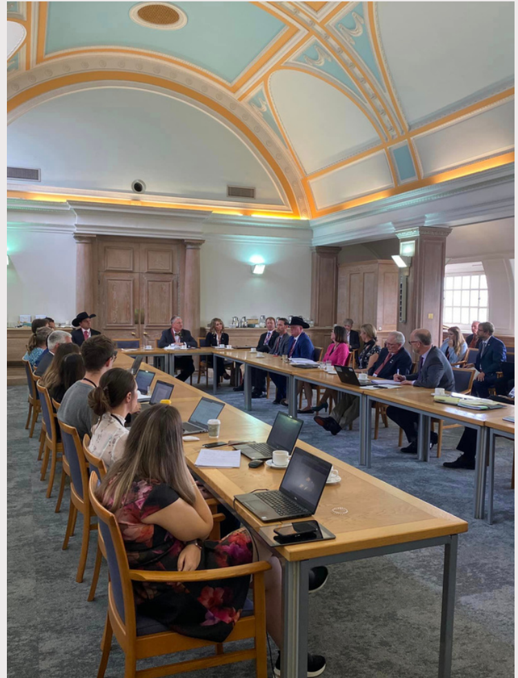
Members of the Nebraska Delegation Meet with Policy-Makers at DEFRA in London