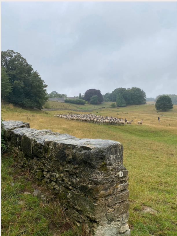
Sheep Herding Near Miserden

Nebraska Sorghum thanks Governor Ricketts for his leadership. The successes in London would have been impossible without the guidance also of the Nebraska Department of Agriculture and the Nebraska Department of Economic Development.