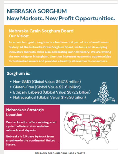
Nebraska's Strategic Geography

At Nebraska Sorghum, we are keen to encourage these companies to consider our state as a prime launching point for accessing North American consumer markets. Our work on trade is as focused on international commodity exports as it is on selling the unique business climate and advantages to an efficient supply chain found in Middle America.