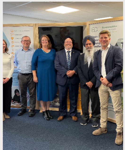
Right: Team Nebraska with the Biorenewables Development Team