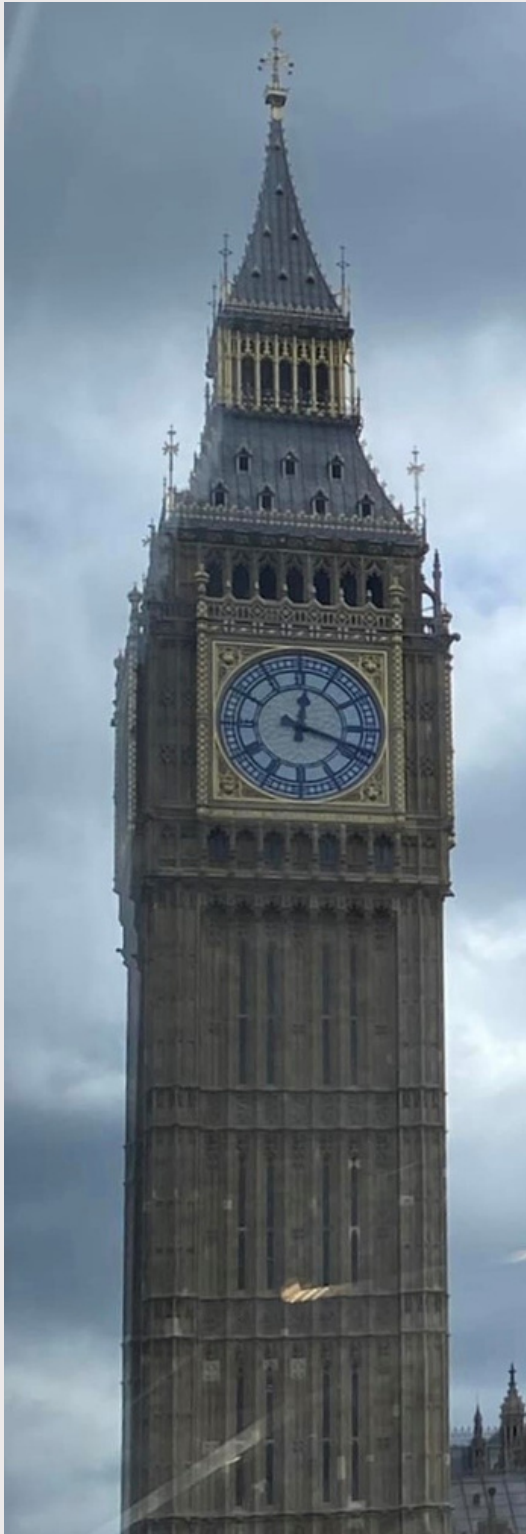
"Big Ben" London, UK