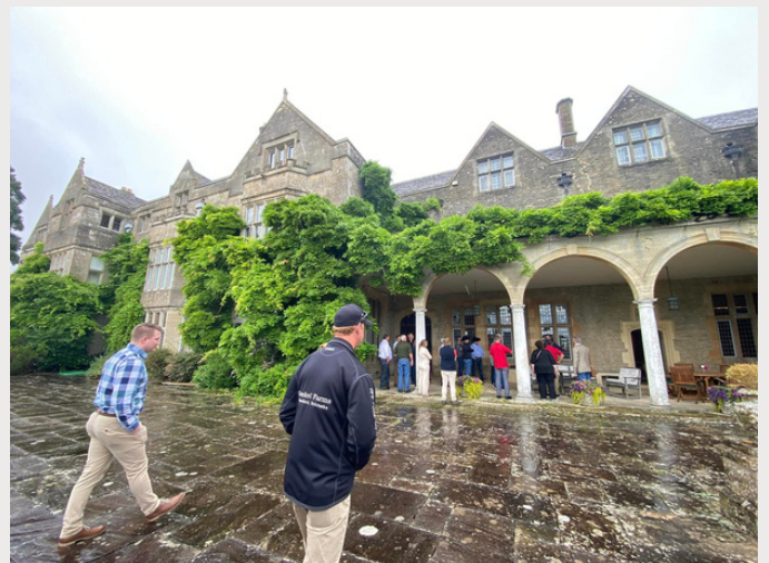
Lunch at the Miserden Estate, Built in 1066