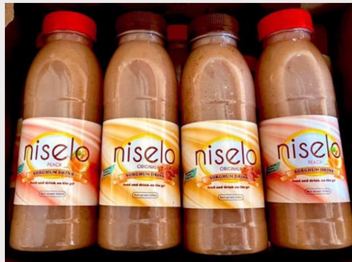
Niselo, a Kombucha-Style Energy Drink made with Sorghum. Available in South Africa at Present