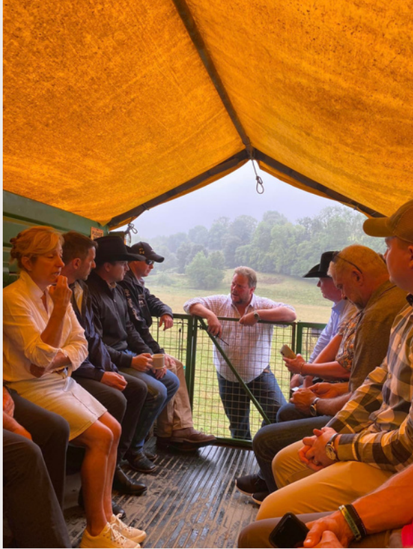
The Nebraska Ag Delegation Visits a Beef Cattle Farm Near London

The Agricultural Delegation spent a day in the English countryside, visiting a beef cattle operation and a sheep operation near the ancient town of Miserden. The estate and village of Miserden has been in constant occupation since 1066. Both visits highlighted the emphasis on increasingly efficient conservation practices being incorporated by farmers in the United Kingdom.