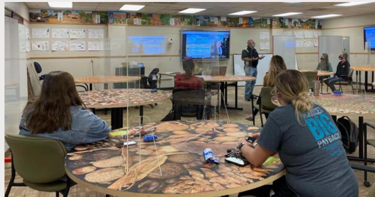
Nebraska FFA Alumni Club at the University of Nebraska-Lincoln