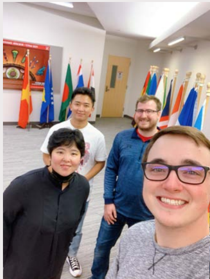
Catalyst teams at the University of Nebraska-Lincoln and Concordia University in Seward

•Five Teams (University of Nebraska-Lincoln/Concordia University-Seward)