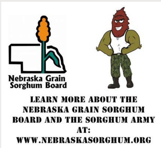
Nebraska Sorghum's annual advertisement in the FFA 'Blue and Gold' magazine