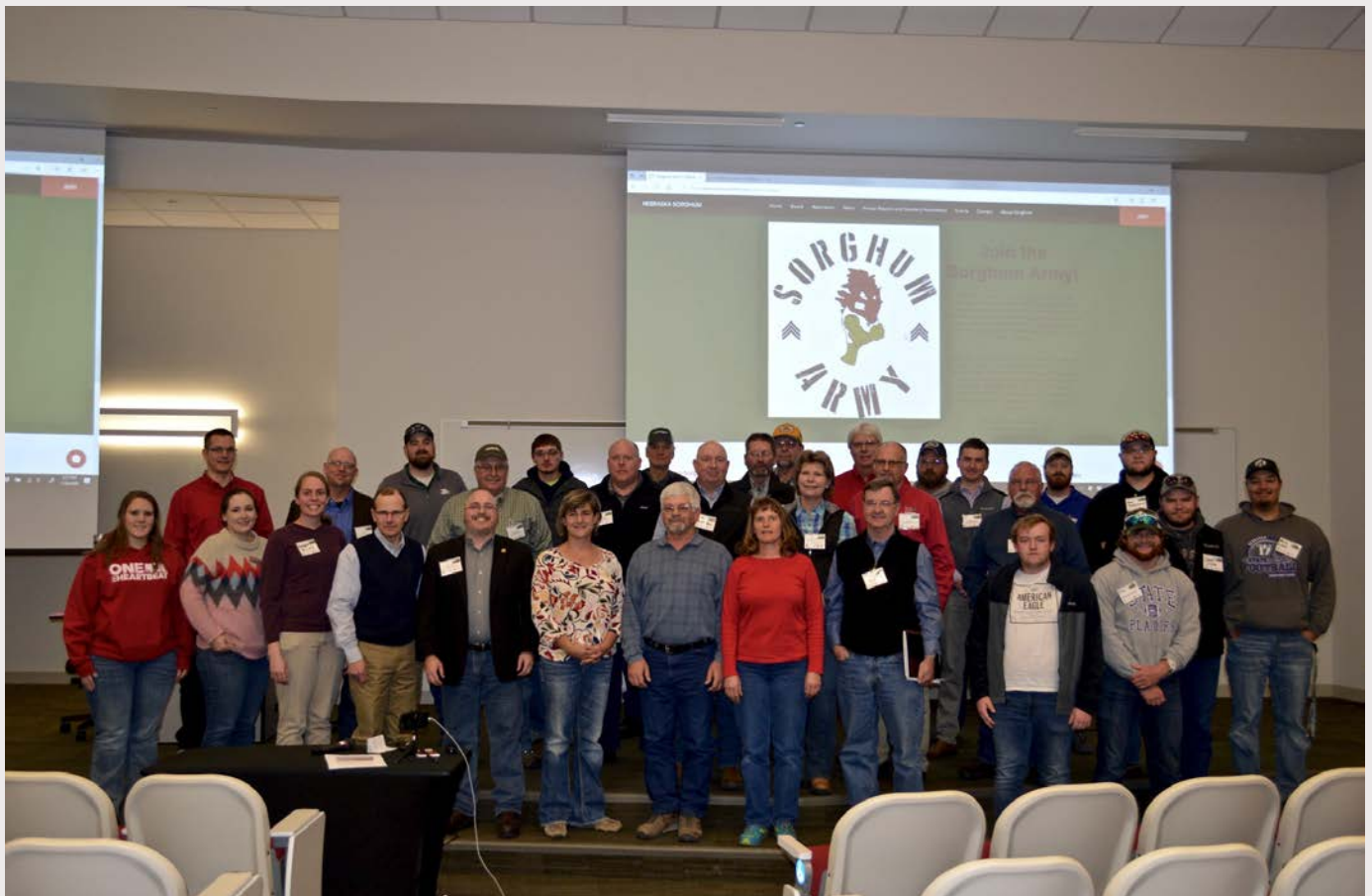
Participants at the 2020 Sorghum Symposium