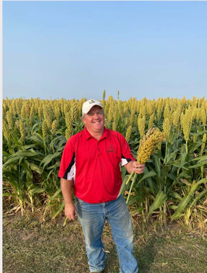
USCP Board Member and NGSB Board Vice Chair holds food-grade sorghum heads