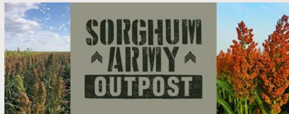
The Sorghum Army Outpost