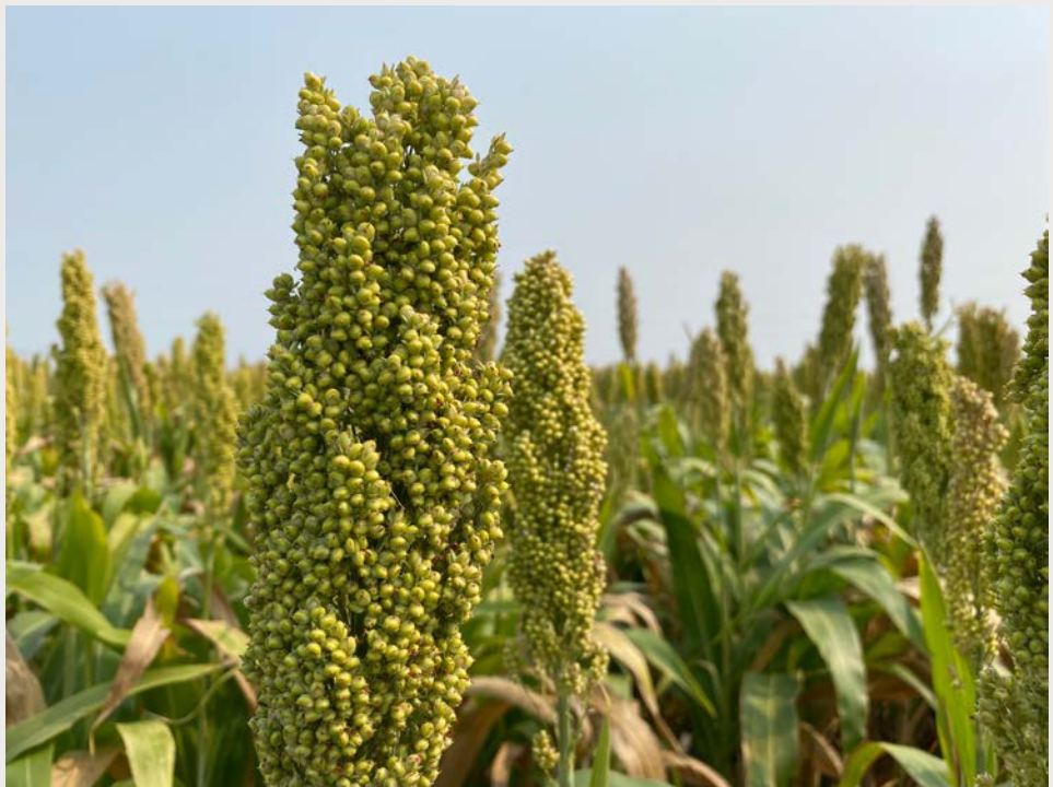
A beautiful food-grade sorghum field near Battle Creek, NE