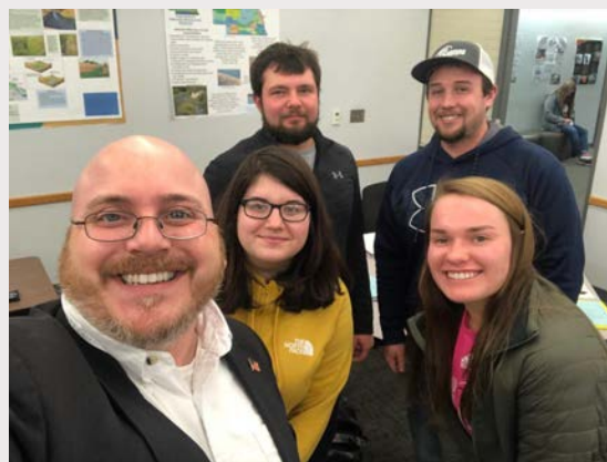
Remote Internships at Northeast Community College