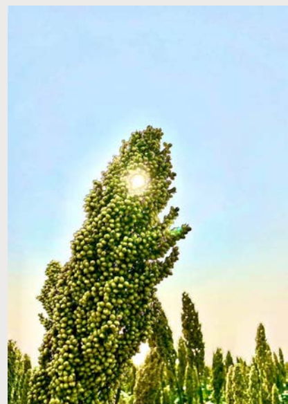
Sorghum in the sun